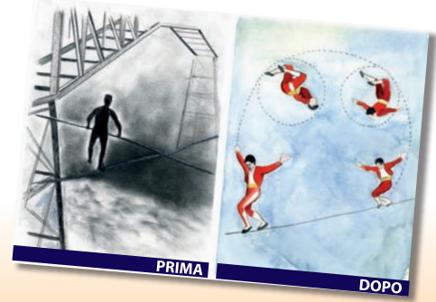
28 year young man

Follow up at prearranged intervals or checkup to monitor the newly acquired fluency. .