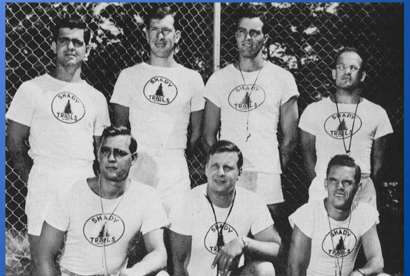
1948 Physical Education Staff