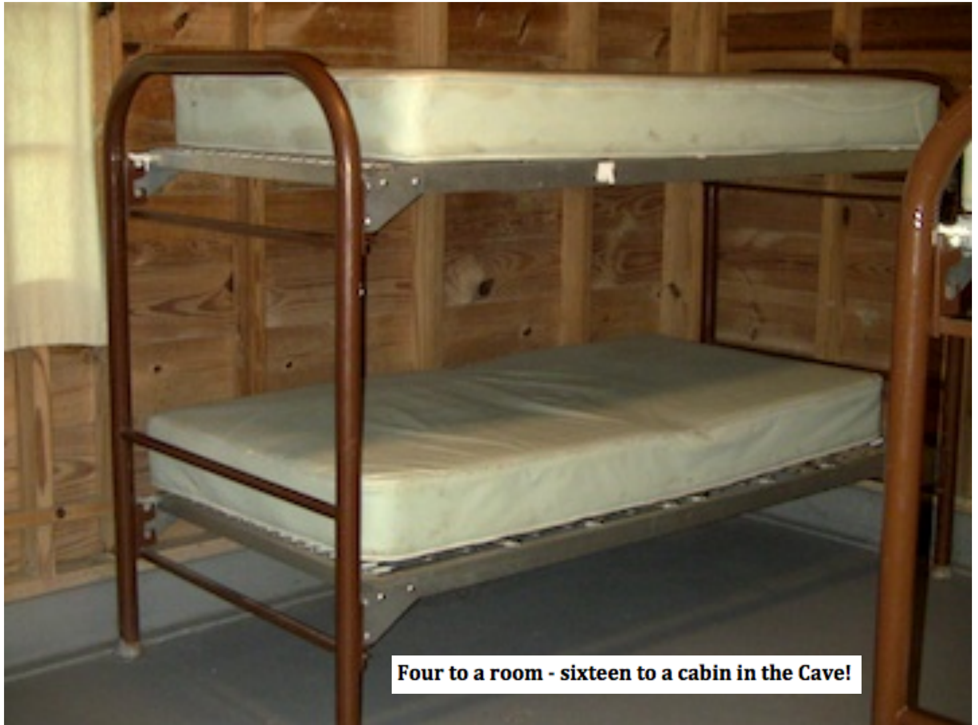
Four to a room - sixteen to a cabin in the Cave!