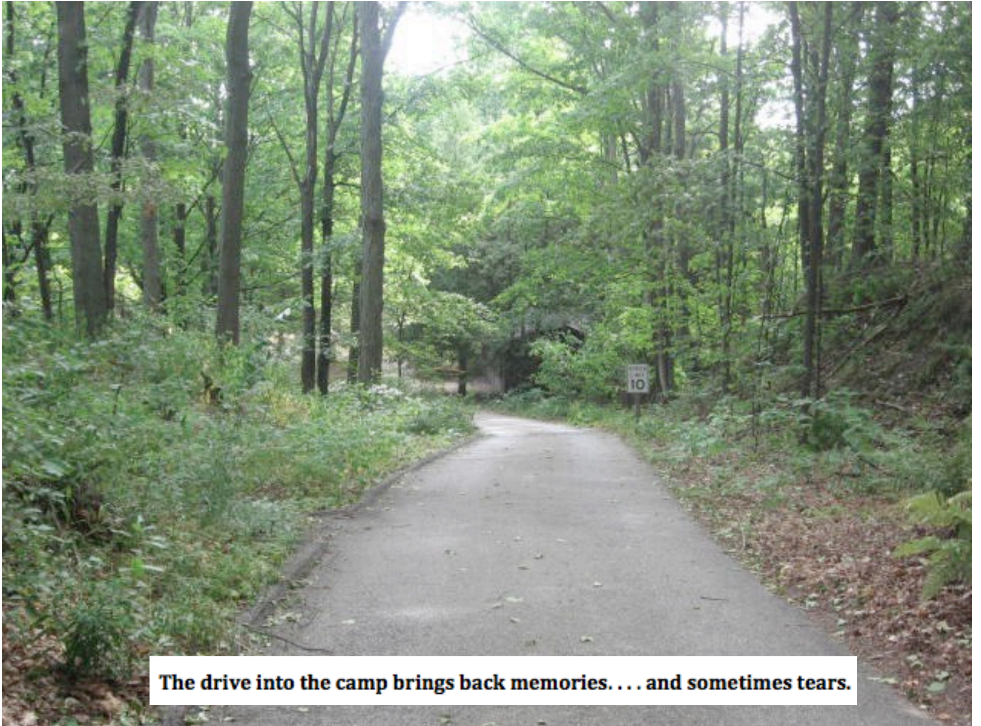
The drive into the camp brings back memories. . . and sometimes tears.