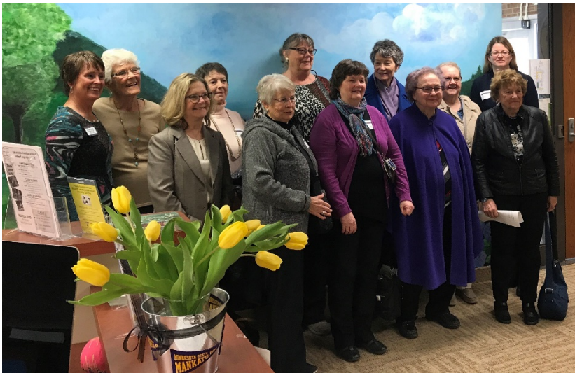
Emeriti Faculty Tour and Visit School of Nursing Faculty to Learn about Recent Initiatives

A purpose of the Glen Taylor Nursing Institute for Family and Society is to nurture an intellectual community of scholars focused on education, practice and research to improve family and societal health. In addition to faculty currently teaching at Minnesota State University, Mankato the Taylor Institute worked throughout this year to reengage retired faculty and alumni in our mission and direction. Multiple prior faculty have been instrumental in supporting the SON directions. For example, launching a graduate program and expanding to the metropolitan area has created opportunities for students and faculty. One of the opportunities in the metropolitan area is the Health Commons at Pond , a nurse-managed school-based health center with a care model that bridges the school setting, family, and the community developed by the SON. The Institute created opportunities to reengage prior faculty and alumni by inviting them on a bus tour to the Edina classrooms, Health commons at Pond, and Maverick Family Nursing Simulation Center. These faculty and alumni learned about current accomplishments and initiatives with several faculty now working closely with the Institute to plan annual events. A goal of this group is to continue engaging faculty and alumni and renew the commitment to the SON and Minnesota State University, Mankato.