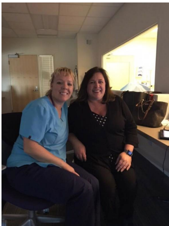
School of Nursing Faculty Consult with SUNY Polytechnic Institute of Utica, NY