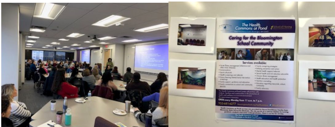
Participants heard from speakers and each of the school-based health centers prepared a poster display from each SBHC site to share with Alliance members.