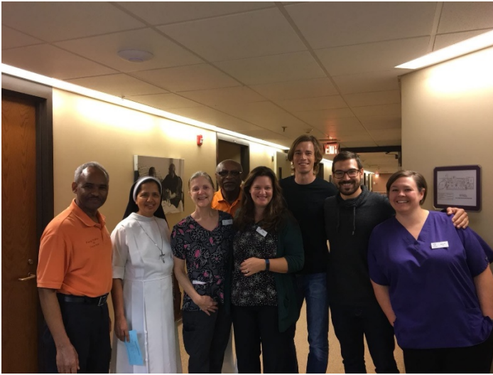
Nursing students from Austria Tour Our Lady of Peace Hospice in Saint Paul, MN