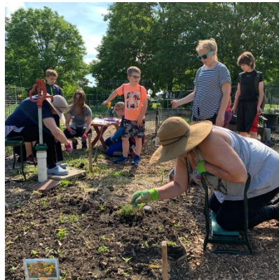
Interprofessional Collaboration between College of Allied Health and Nursing Departments