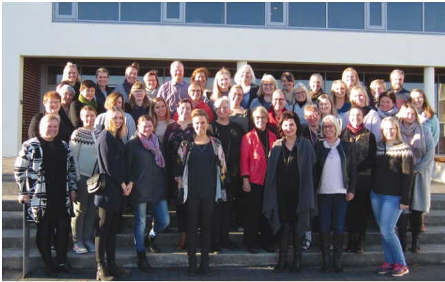
40 Healthcare Professionals from Iceland, Denmark, Sweden and USA attend Externship in Iceland