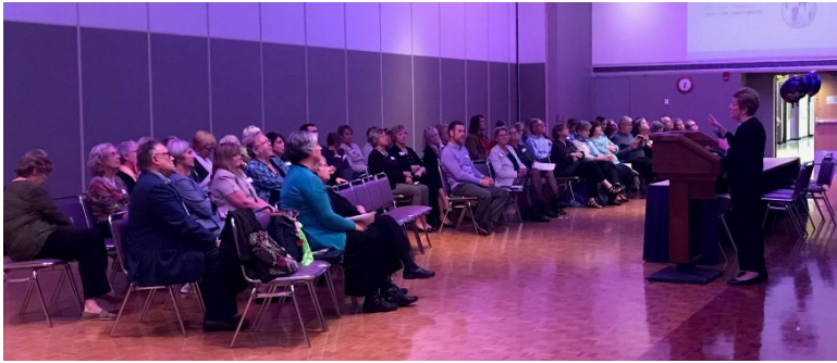
Taylor Visiting Scholar Addresses Alumni about Creating a Legacy at MSU