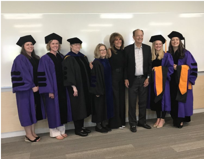
Graduates Ready to March in Spring 2019