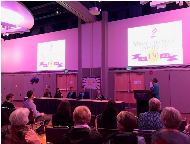
Alumni Panel Sharing their Family and Community Nursing Experiences